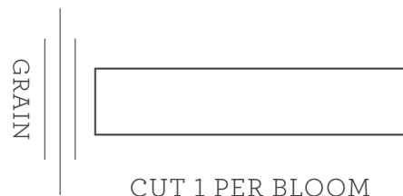
CUT 1 PER BLOOM